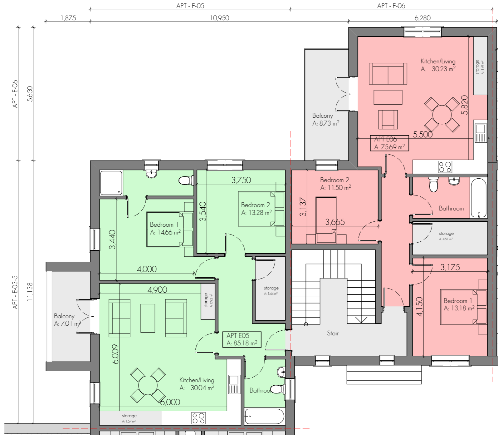
FIRST FLOOR 1:100